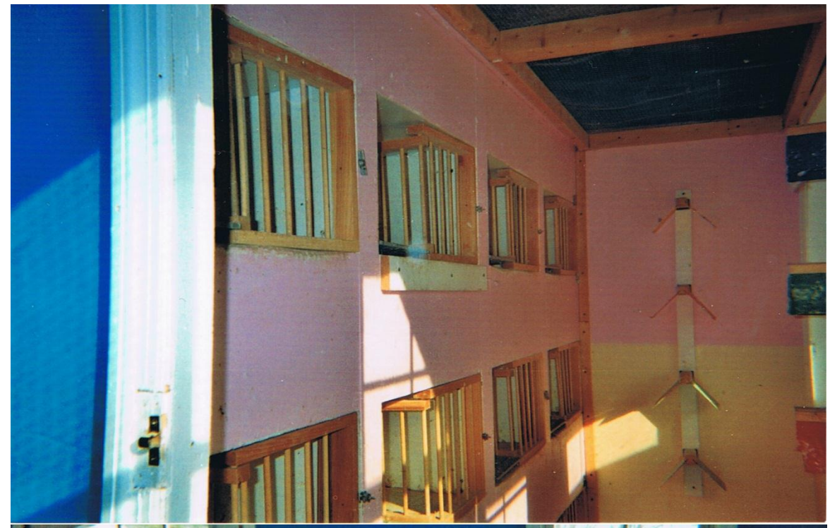
Photo of the nest boxes I can use to breed out of. This section will be used for 2012 birds. The walls are painted pink to hold back aggressive birds from fighting. I can't prove it helps.