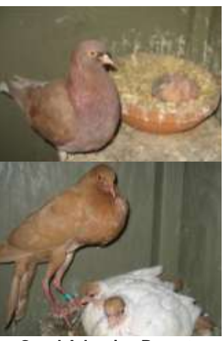
Good Adoptive Parents