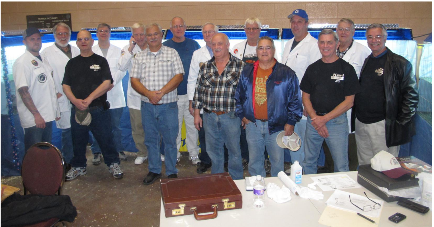
AHA members at 2011 LAPC Pageant