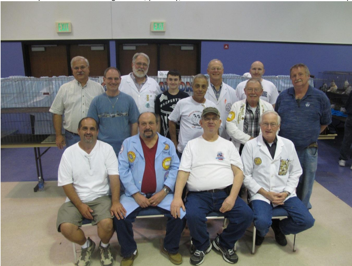
AHA members at the 2012 Florida Grand National

I have suggested this band pool so to have fun and make a few dollars for the club. Even if you can't make the National you will be supporting the AHA. 5 bands = $25, that's only one dinner out. Buy at least 5 bands & the money will be used to improve our club through raffles, publicity, which will then boost our breed & membership.