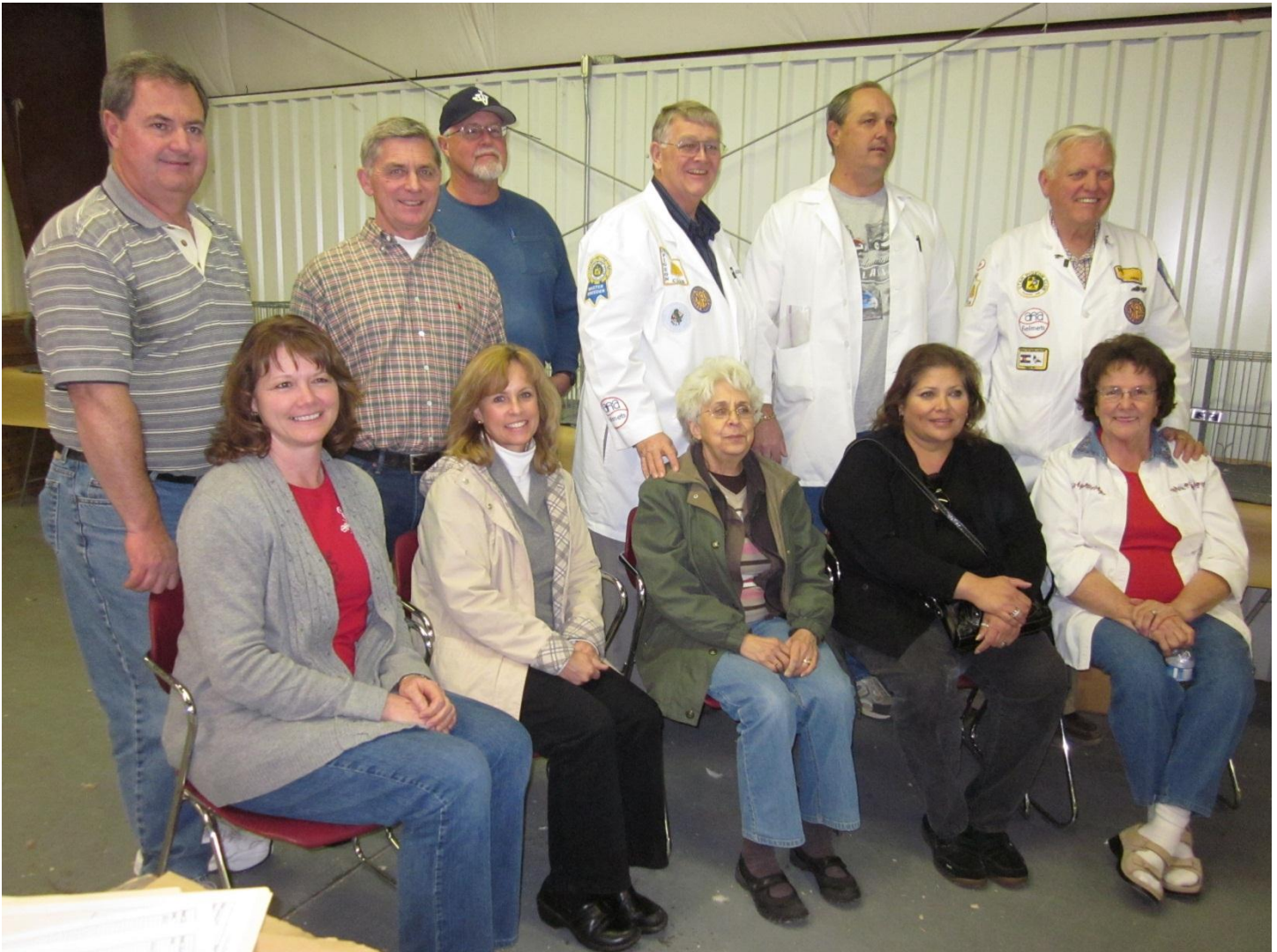
The AHA members and their wives at the 2012 Hurricane Show.