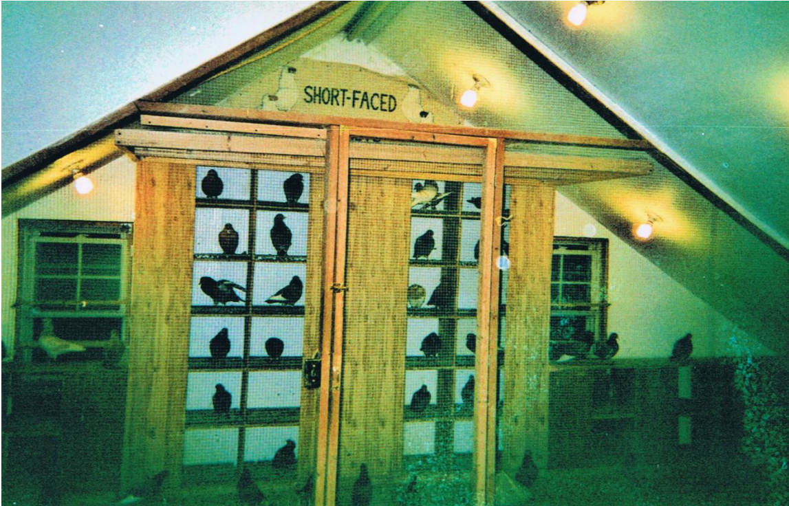
Pumper Section measuring 25' x 6'. 36 nest boxes, 25 pumpers, floor wood grates, and plastic grates in nest boxes.

another hen. Now keep in mind with the size of my loft I can easily have 25 to 30 pair of Helmets to breed from, but I'm looking for the best results with half the effort and time. My suggestion to someone thinking of starting, buy the best cock bird your money can buy get six very nice hens and you're on your way. See you in my column next time.