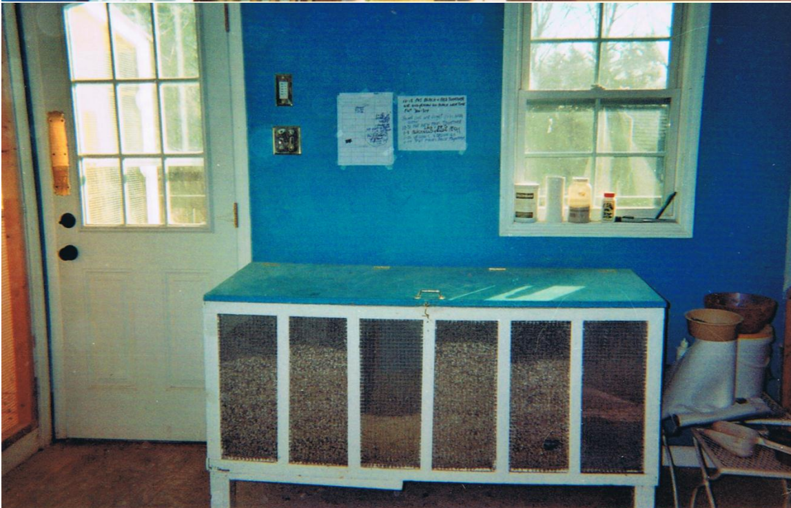
Closed screen feed bin