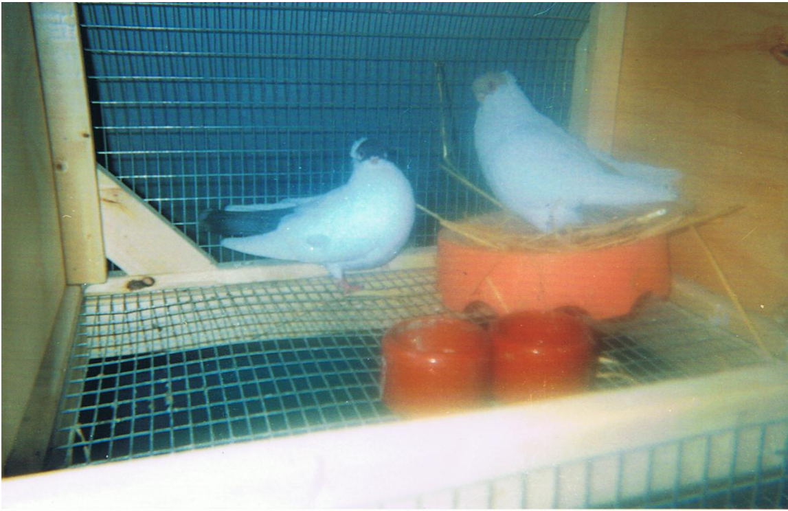
Inside breeding pen Water & feed cup