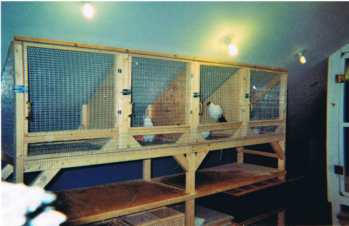
Four individual breeding pens, notice tray at bottom slides out to clean droppings.