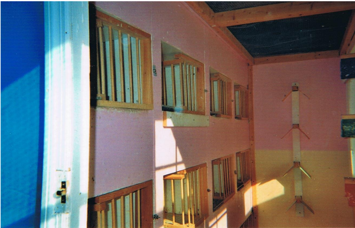
Photo of the nest boxes I can use to breed out of. This section will be used for 2012 birds. The walls are painted pink to hold back aggressive birds from fighting. I can't prove it helps.