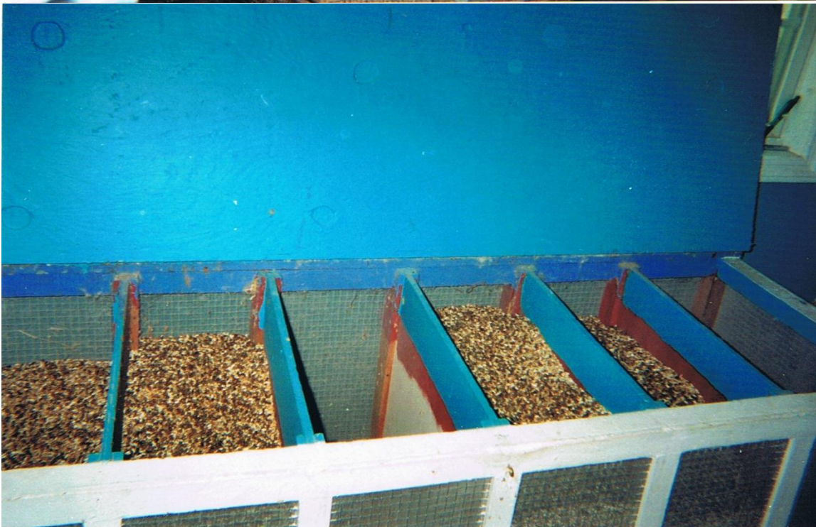
Open screen feed bin I use show topper – feed, safe and dry.