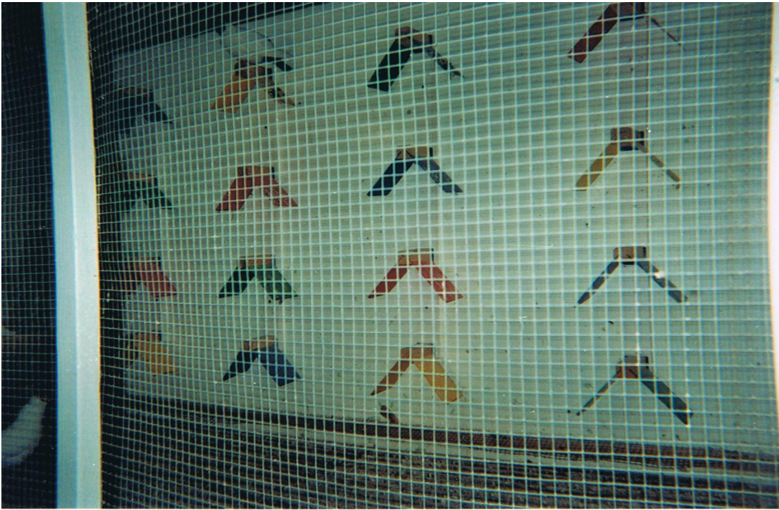
Hen section with ^ perches and wood grated floor. Made to stop hens from mating to each other.