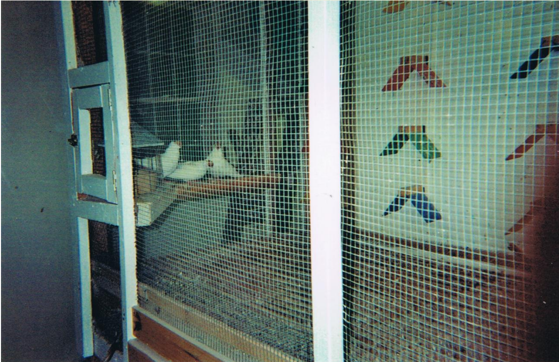
Another view of hen section, water off floor – wooden grates, ^ perches.