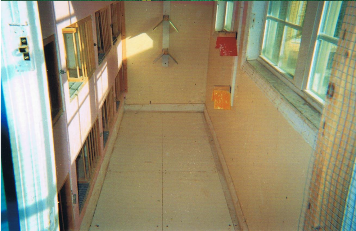
Section I use for 2012 young ones. I can also use this section to breed out of.