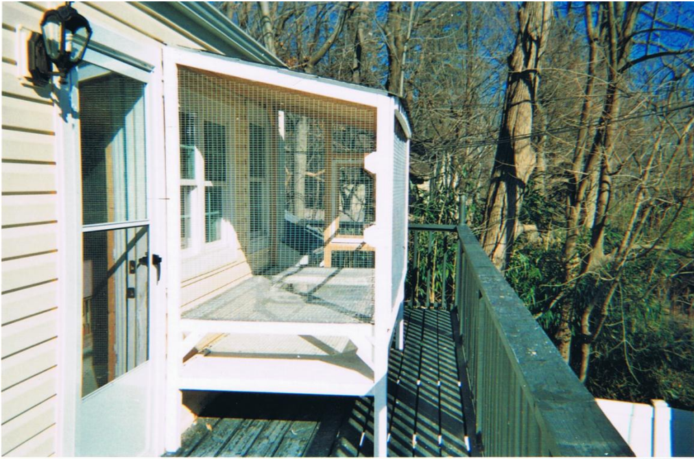
Three photos of Aviary for young ones and extra hens. Note tray at bottom for easy cleaning.