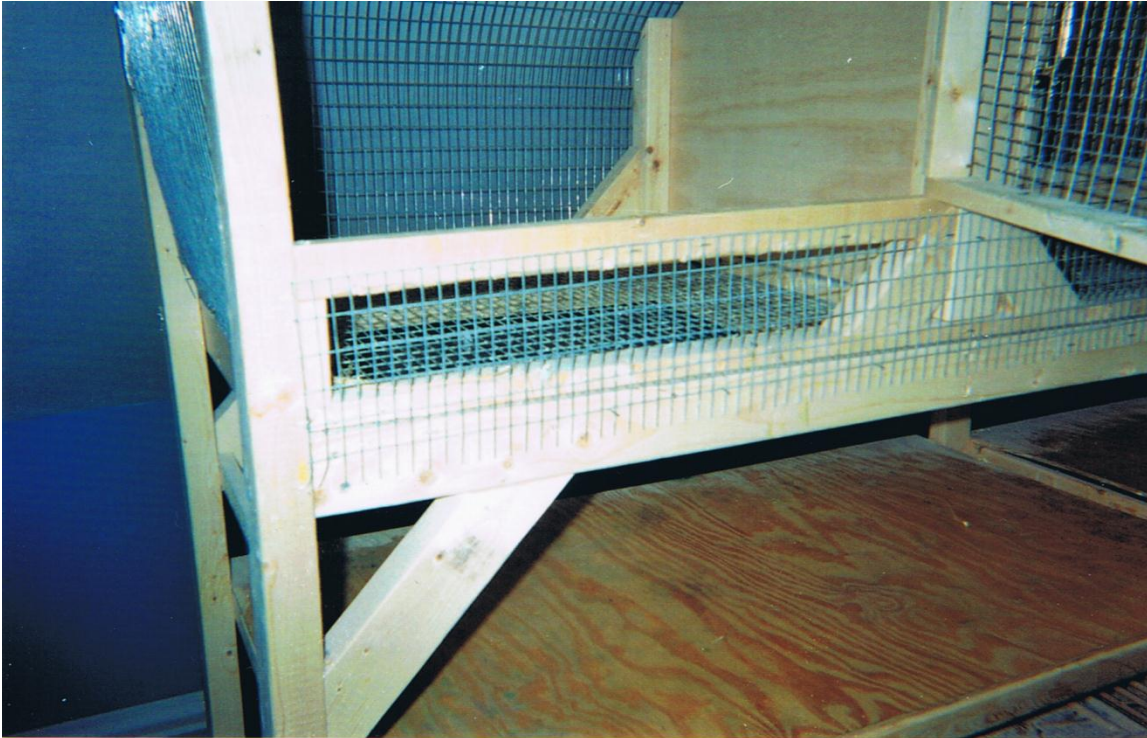
View of breeding pen. Note screen floor and wooden bottom to catch droppings.