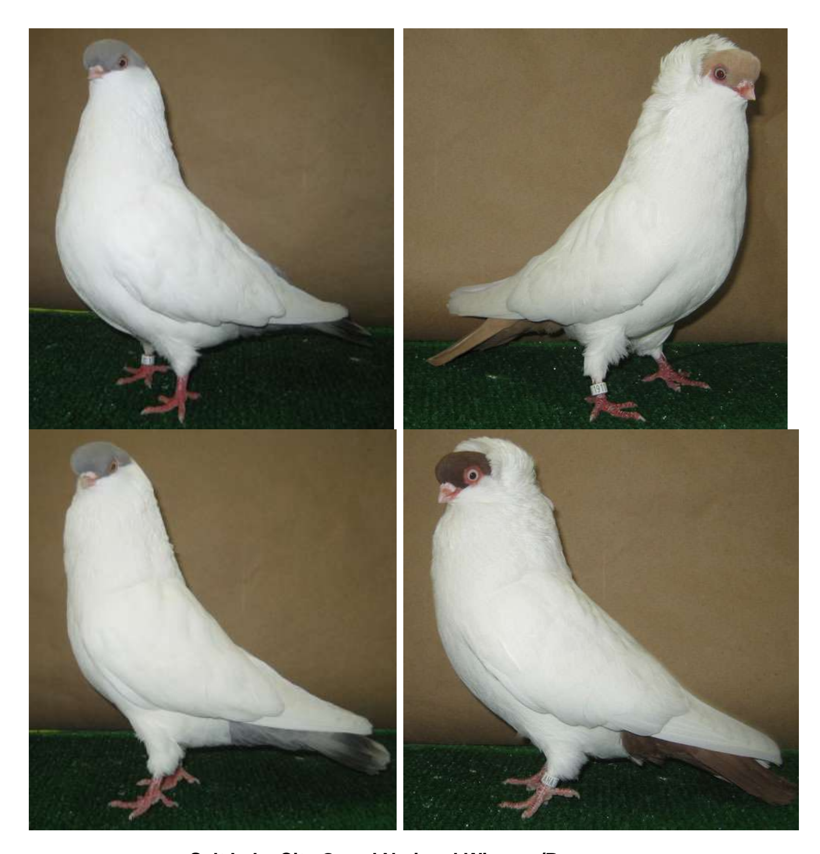
Salt Lake City Grand National Winners/Reserves

Top left: Champion medium face plainhead silver young hen # 1317 bred and shown by Mike Crawford.