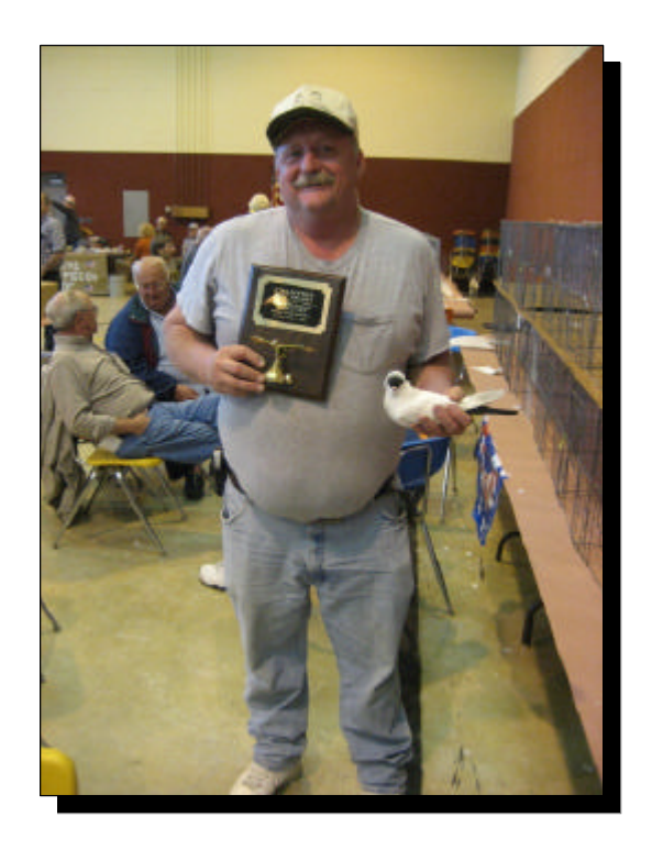
Victor Cline Champion Medium Face Crested