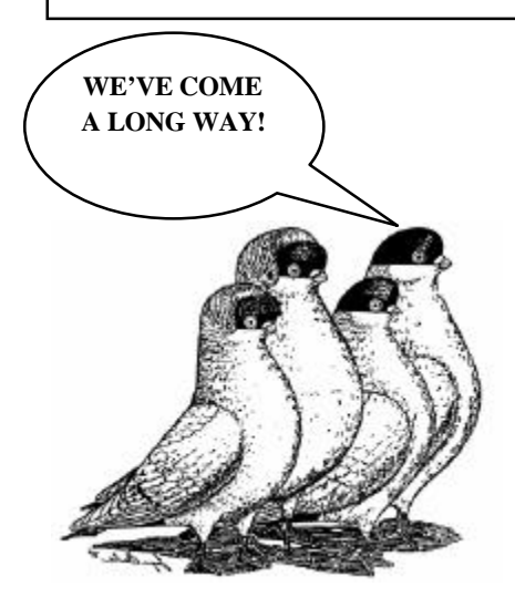
More Back in Time articles are printed throughout the bulletin.

Helmets and the AHA have a lot of things going for them. We need to use these attributes to capture the interest of other fanciers at places where we already go! We can market our breed at the show hall, racing club house, and feed store. At the shows we can do several things. First and foremost we need to keep our entry numbers up. Helmets are a nice looking bird with a lot of personality. A large class of good looking birds will attract other fanciers' interest as they stroll the aisles and judging areas. This may take some focused effort in areas where there are only a few breeders. Placing those extra birds will ultimately pay off. Once the fanciers' interest is captured we then need to tell folks about the club, the bulletin, the great organization of the AHA, our master breeder program, and fun / camaraderie that we all share at the shows. The last thing we need to do is have information and bulletins available (all downloadable on the web site) in the judging area. After we have captured folks' interest we need to give them something to take with them so they will be reminded to join the club! We have tried these techniques at shows in District 7 with great results.