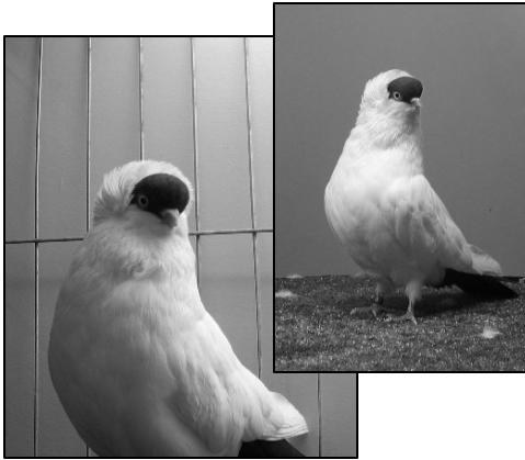
Champion Black OH