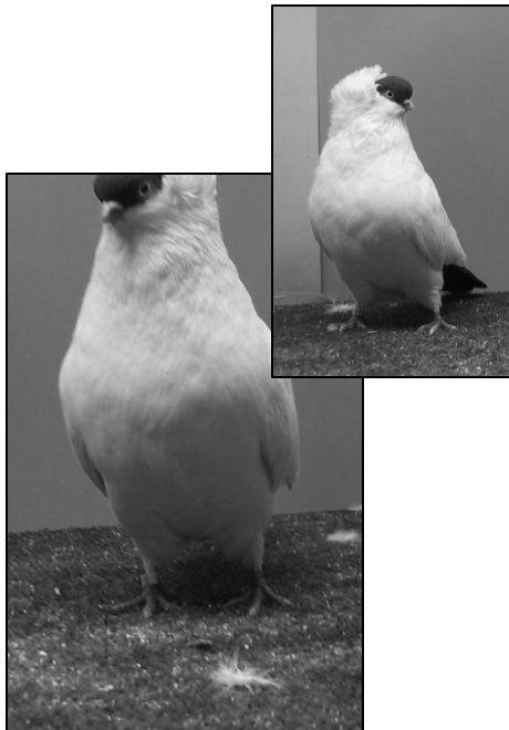
Champion Young Bird Black Hen