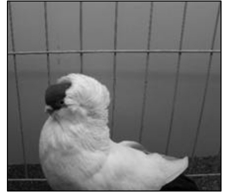
First Reserve Black OC