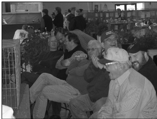
Helmet folks enjoying the Auction action!