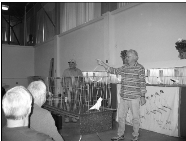
A.H.A. Auction on Saturday

Anyway, if you enjoy different dimensions of excitement at a pigeon show, this Western Sectional really delivered. And in the end we replenished the purse out of the 10% to the club, which is just waiting for the next time we decide to do it again. Good luck at the National; see you there.