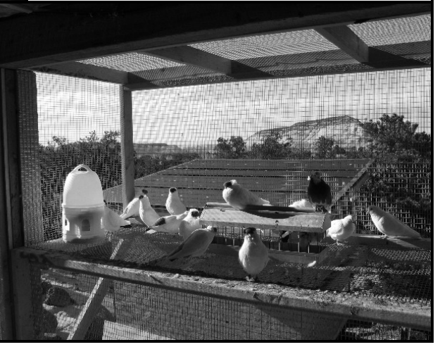
Sun Porch in breeder loft

standard and simply banter around issues and then see where it goes. Anyway, I'm sure that a lot of you by now are seeing some hopeful prospects in your loft. Good luck.