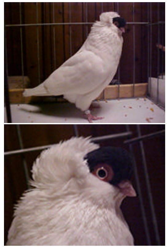
Lancaster Champion, Black Old Cock #03-2719 Owner, Raul Delgado